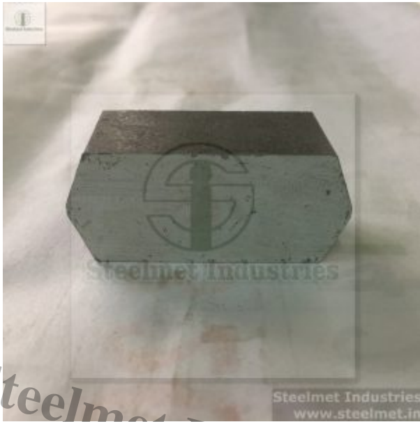
Flat with Pointed Sides steel