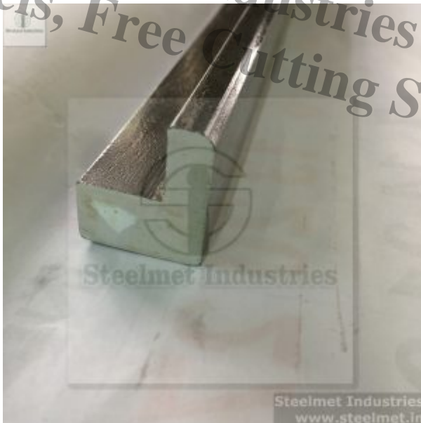
Angular Slide Steel Section