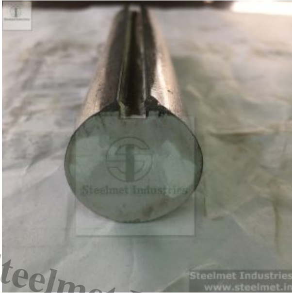
Round Shaft with Keyway Slot (Cold Finished)