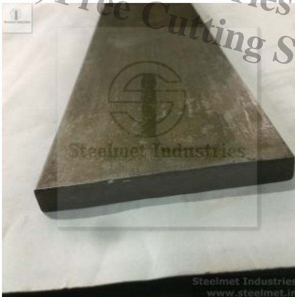
SHARP CORNER FLATS - Cold Finished Precision for Superior Performance

Steelmet Industries - Bright Bars, Alloy Steels, Free Cutting Steels, Stainless Steels