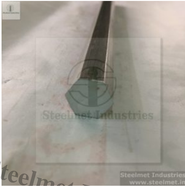
Regular Hexagon Steel Shape