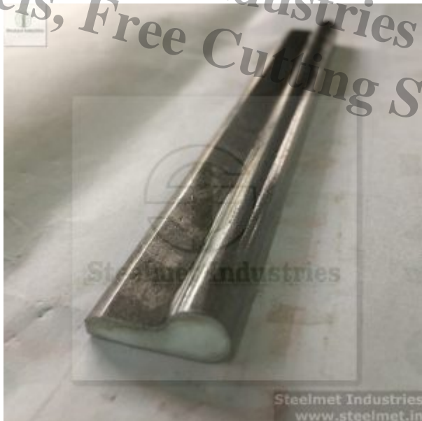
Precision in Every Angle: Pawl Section

Steelmet Industries - Bright Bars, Alloy Steels, Free Cutting Steels, Stainless Steels