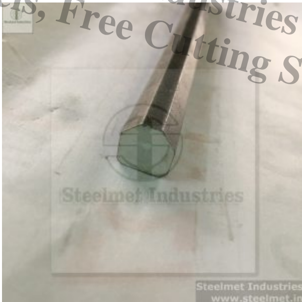
Irregular Hex Rounded Corners Steel Section

Steelmet Industries - Bright Bars, Alloy Steels, Free Cutting Steels, Stainless Steels