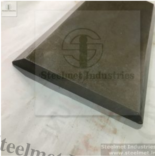
Both Side Taper Flats