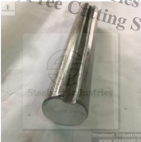
Round Shaft with Keyway Slot (Cold Finished)