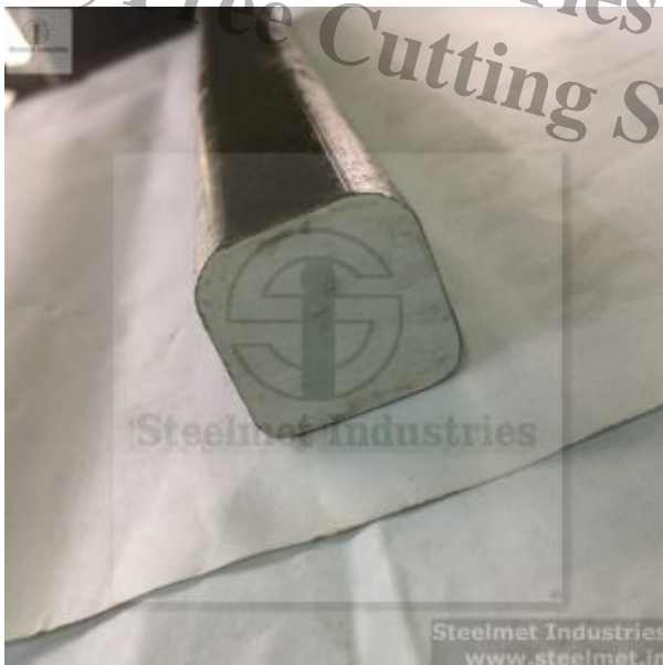
Round Corner Square Steel Bar (Cold Finished)

Steelmet Industries - Bright Bars, Alloy Steels, Free Cutting Steels, Stainless Steels