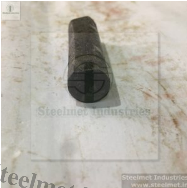
Round with Flat Bottom - Precision Cold Finished Steel