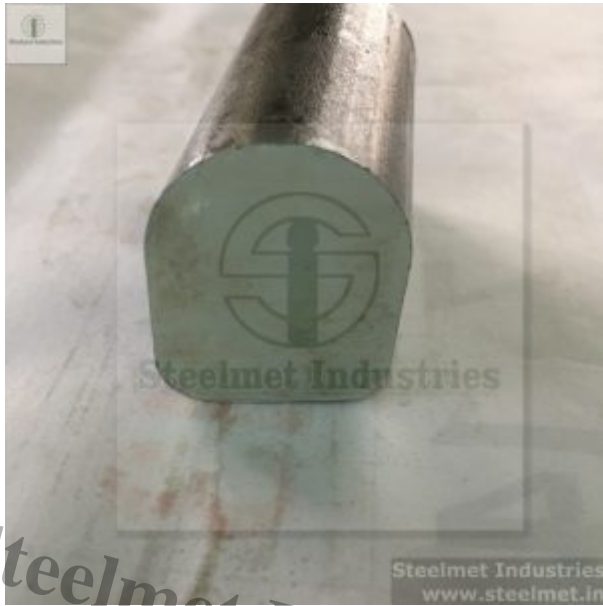
D-Shape Steel Section