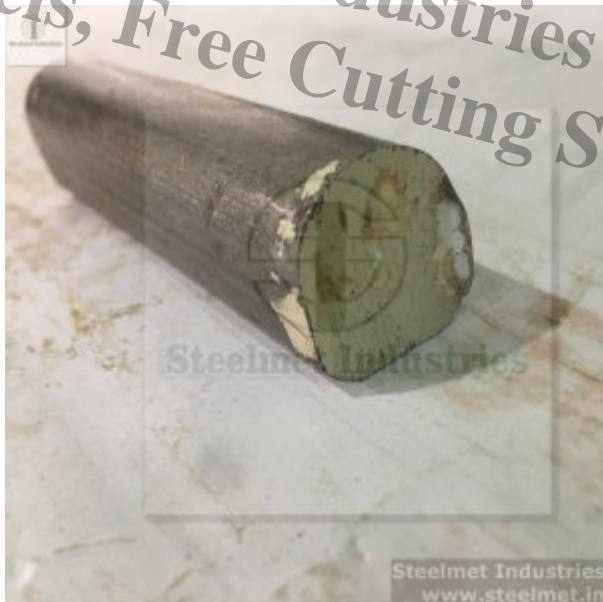
D-Shape Steel Section

Steelmet Industries - Bright Bars, Alloy Steels, Free Cutting Steels, Stainless Steels