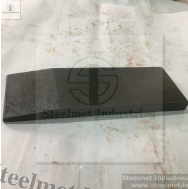
One Side Taper Flat