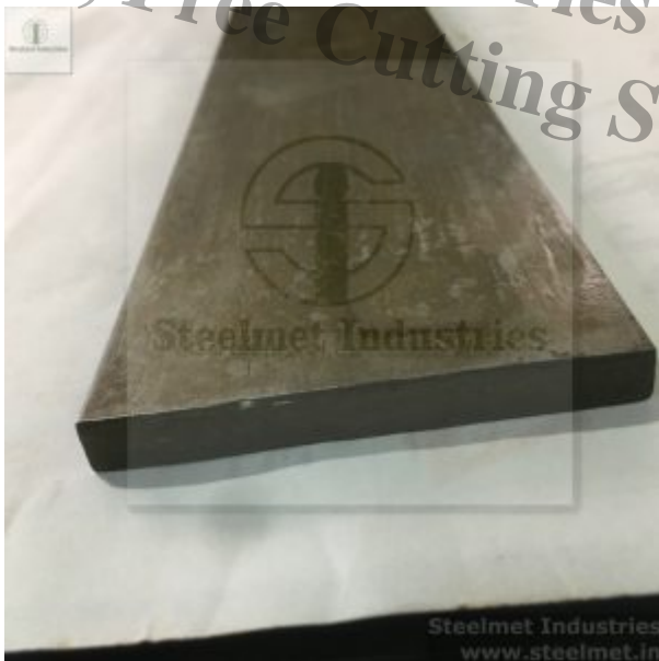
SHARP CORNER FLATS - Cold Finished Precision for Superior Performance

Steelmet Industries - Bright Bars, Alloy Steels, Free Cutting Steels, Stainless Steels