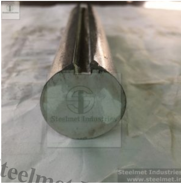
Round Shaft with Keyway Slot (Cold Finished)