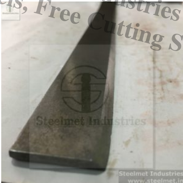
One Side Taper Rounded Corner Flat Steel

Steelmet Industries - Bright Bars, Alloy Steels, Free Cutting Steels, Stainless Steels