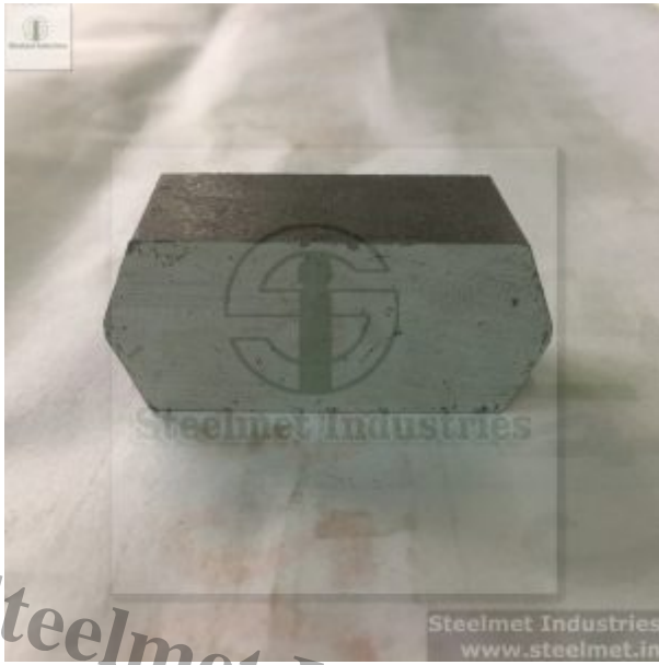
Flat with Pointed Sides steel