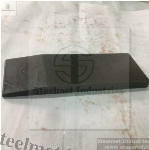
One Side Taper Flat