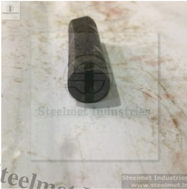
Round with Flat Bottom Precision Cold Finished Steel