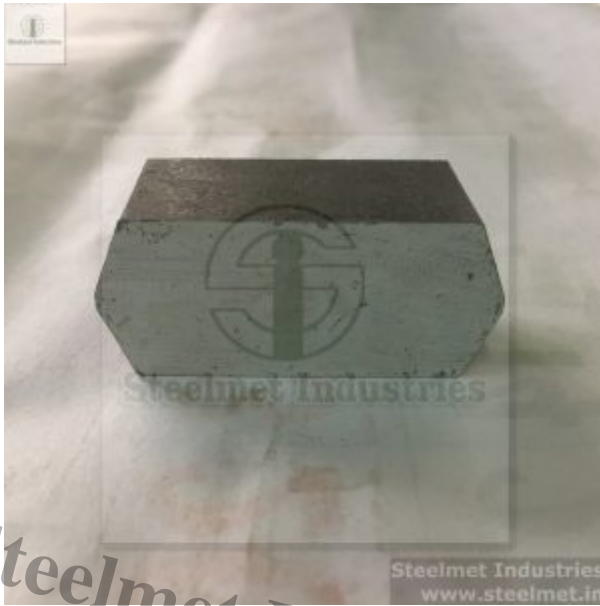
Flat with Pointed Sides steel