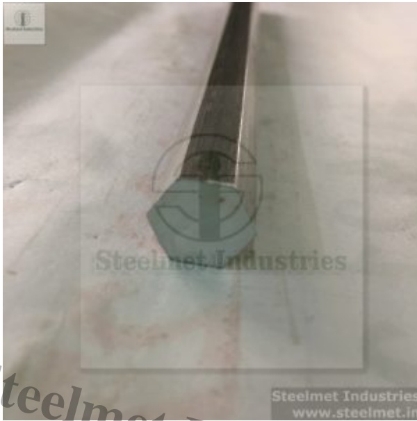
Regular Hexagon Steel Shape