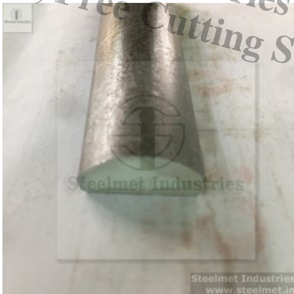
WOODRUFF D-Section Steel in Cold Finished Condition