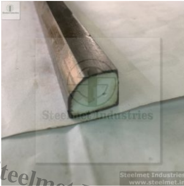
Square Chamfered Pentagon in Cold Finished Condition