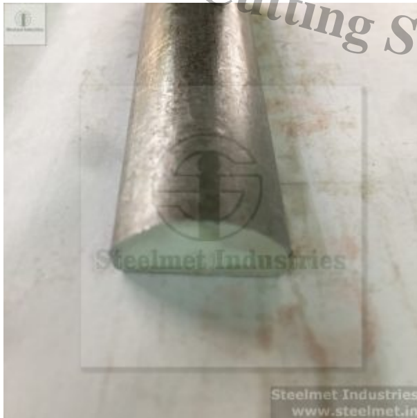
WOODRUFF D-Section Steel in Cold Finished Condition

Steelmet Industries - Bright Bars, Alloy Steels, Free Cutting Steels, Stainless Steels